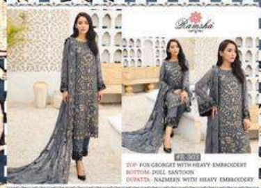
TOP: FON GEORGET WITH HEAVY EMBROIDERY BOTTOM: DILL SANTOON DUPATTA: NAZMEEN WITH HEAVY EMBROIDERY