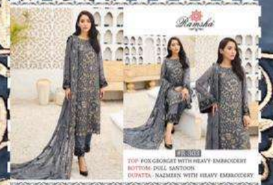
TOP: FOL GEORGETT WITH HEAVY EMBROIDERY, BOTTOM: SUELL SANTOON, DUPATTA: NAZMEEN WITH HEAVY EMBROIDERY