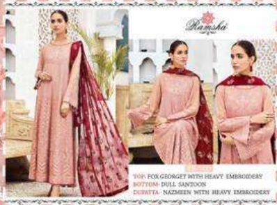
TOP: FOX GEORGET WITH HEAVY EMBROIDERY BOTTOM: DULI SANYOON DUPATTA: NAZMEEN WITH HEAVY EMBROIDERY