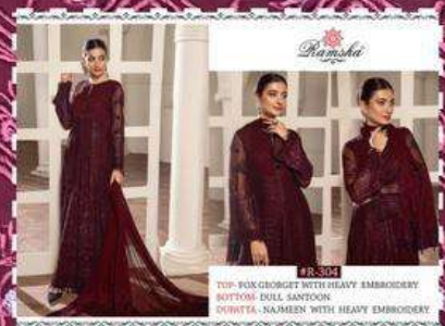
TOP: FOX GEORGET WITH HEAVY EMBROIDERY BOTTOM: SKILL SANDOON DUPATTA: NAMREEN WITH HEAVY EMBROIDERY