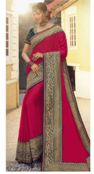
• 6409 •