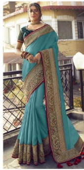
• 6406 •