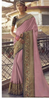
• 6403 •