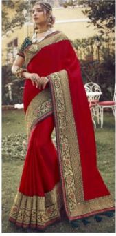
• 6401 •