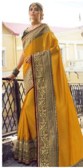
• 6405 •