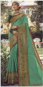
• 6404 •