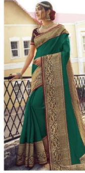
• 6407 •