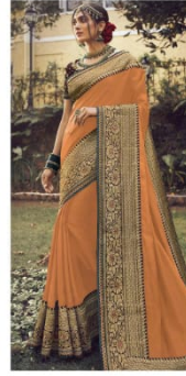
• 6408 •