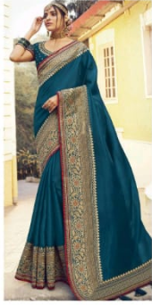
• 6402 •