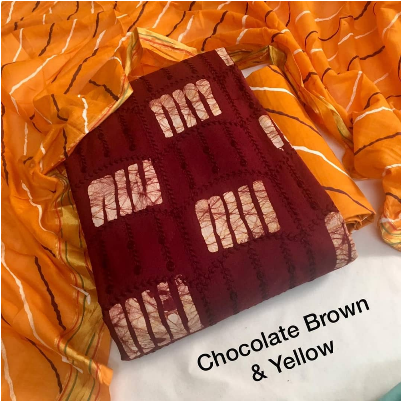
Chocolate Brown & Yellow