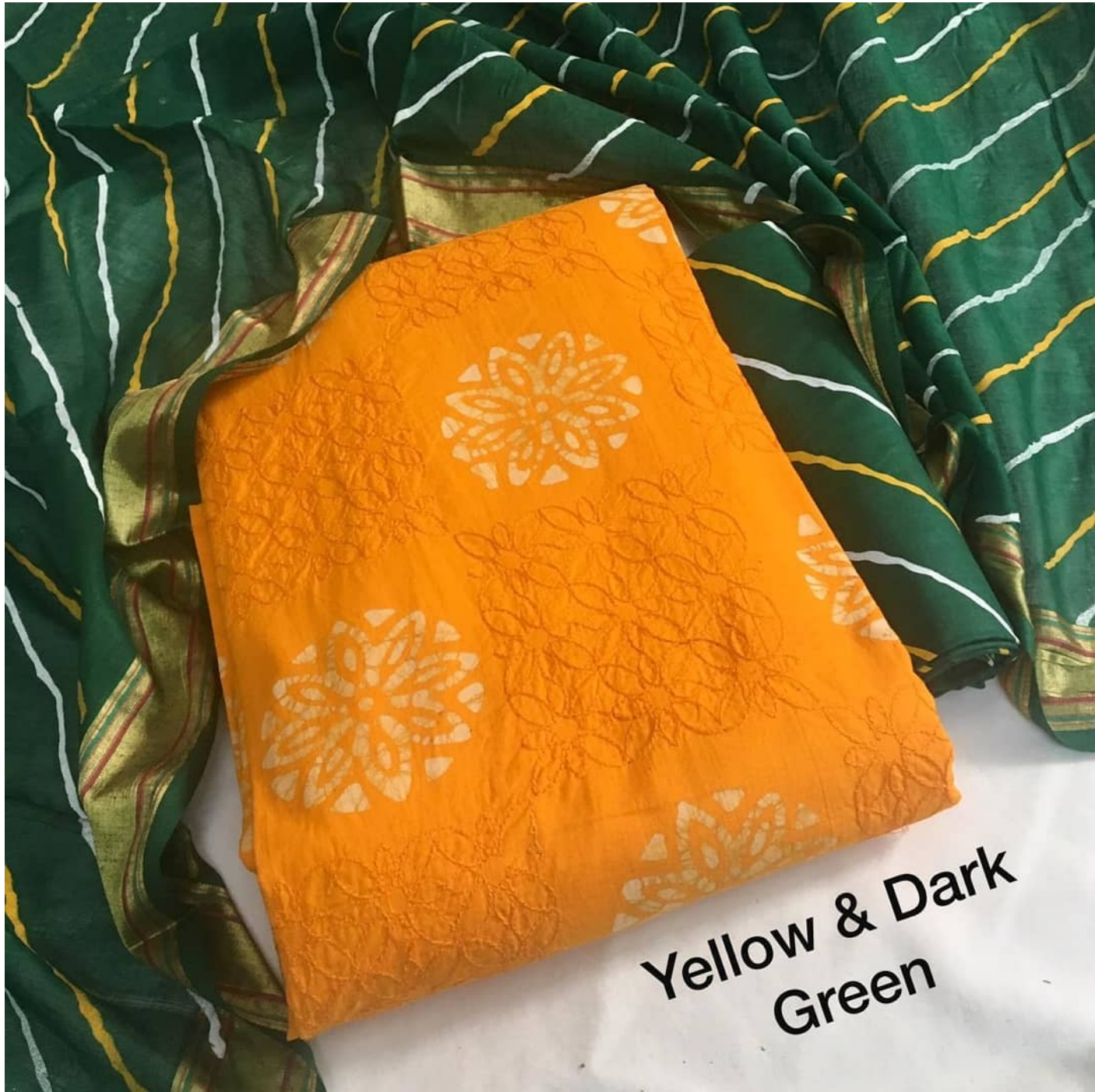
Yellow & Dark Green