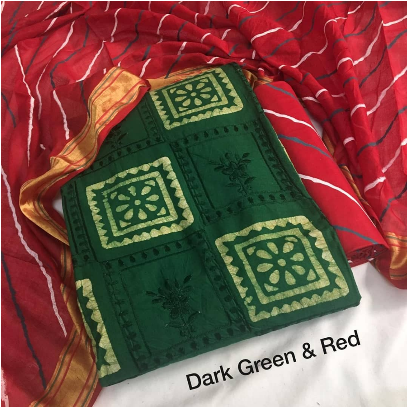
Dark Green & Red