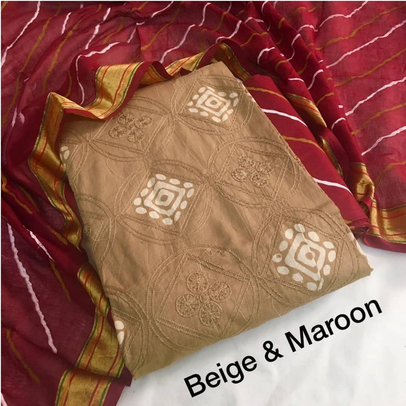
Beige & Maroon