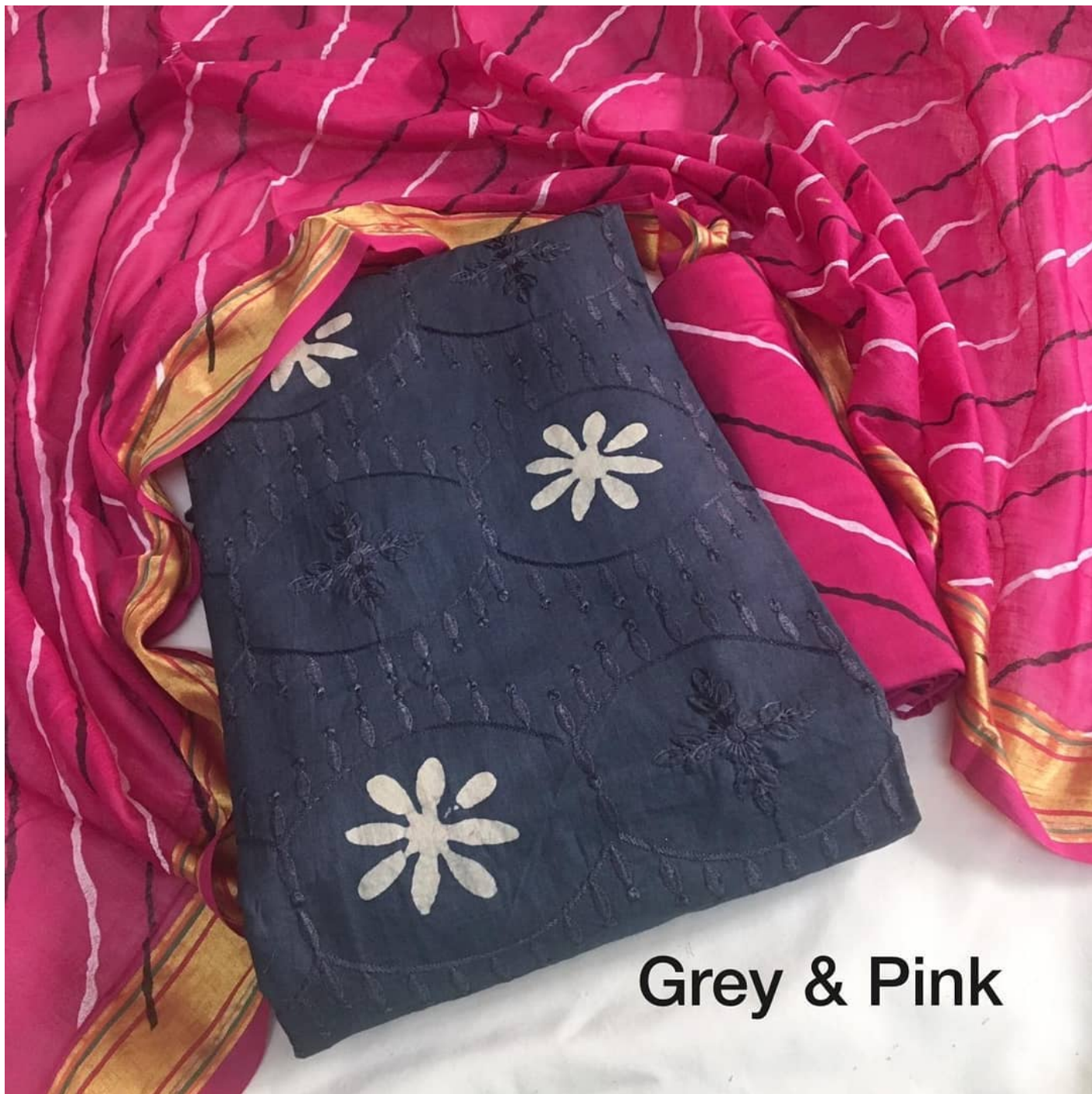
Grey & Pink