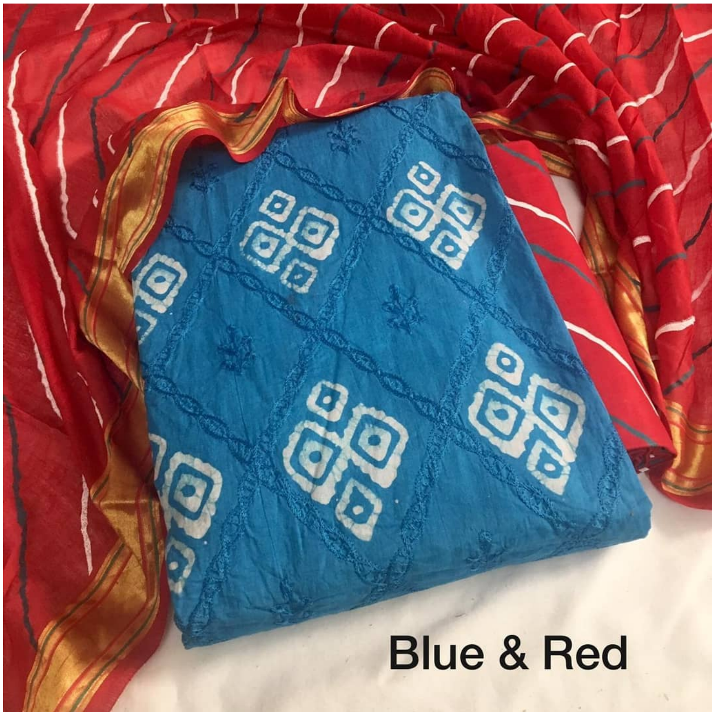
Blue & Red