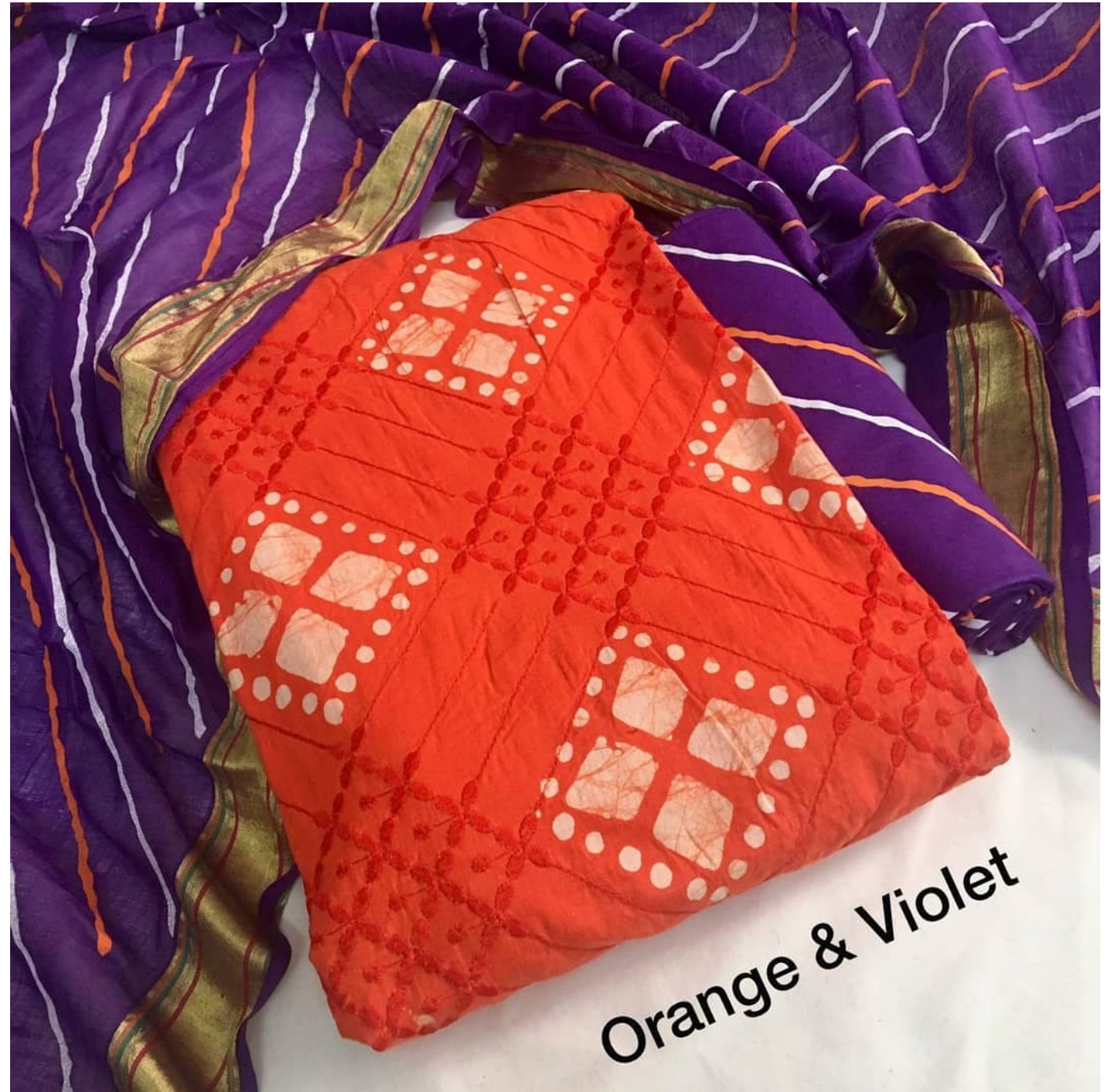
Orange & Violet