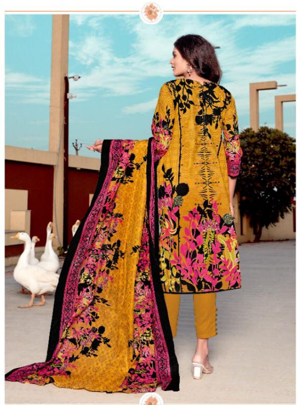
Reflection Style -1002