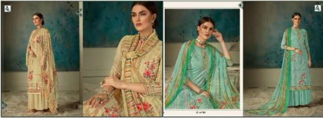
◀ I 647 003