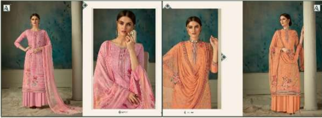
◀ I 647 001