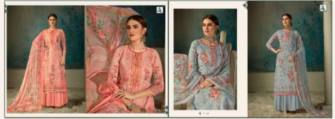
◀ I 647 005