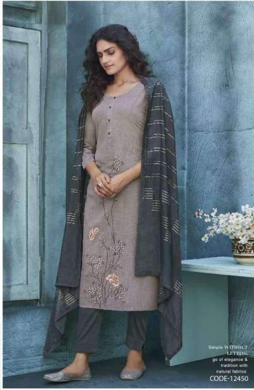
Simple WITHIN IT LITTING go of elegance & tradition with natural fabrics CODE-12450