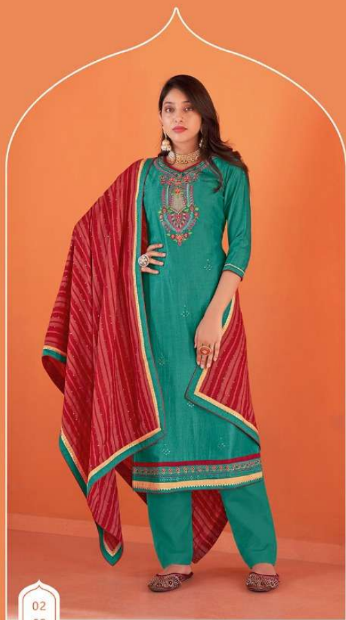
❖ Made in India, with love by our designers