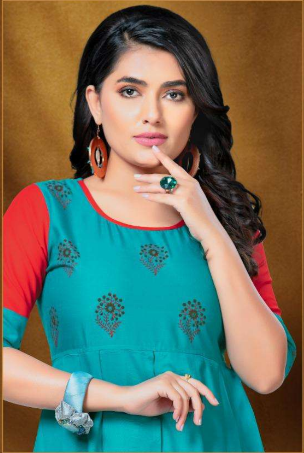
Indigence is more than a fashion label-It's way to embrace conscious clothing and consumption