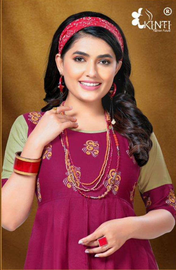
signature piece is one that has our iconic style and top quality craftsmanship, all in one object