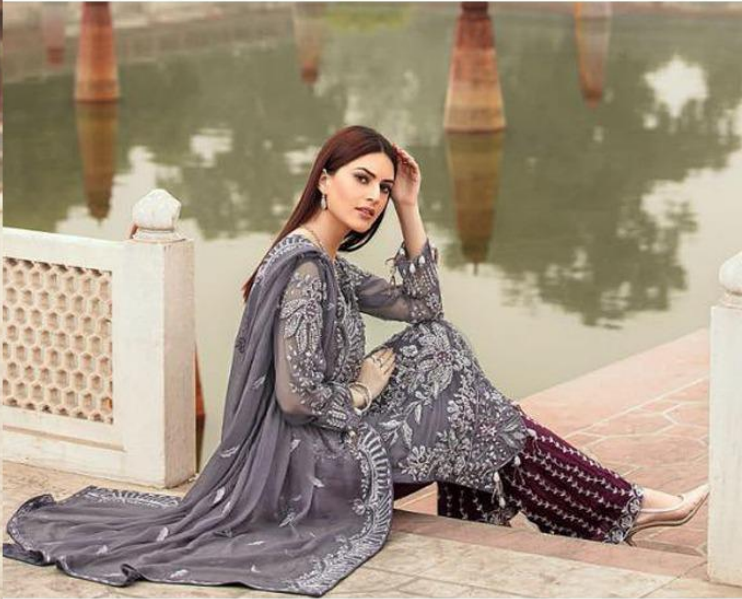
Top- Georgette heavy embroidered with daimond work Inner- Santoon silk Bottom- Santoon self embroidered Dupatta- Nazneen heavy embroidered