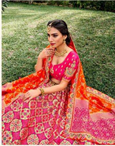
Replace your out of date wardrobe with exotically patterned collection enhances feminine touch to your personality