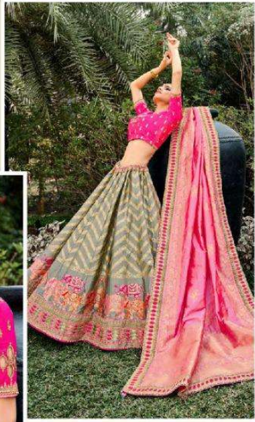
This wonderful blended pattern has a keep it forever feel like treasure, enjoy the bold design.