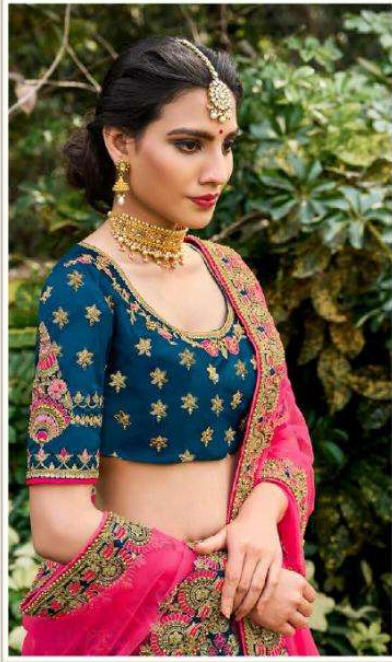
The key pieces for you to choose your fashion inspiration