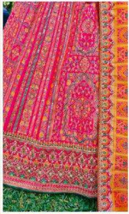
Elegance and sophistication create a charming symphony