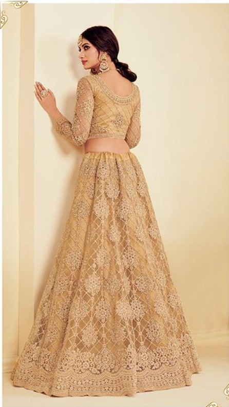
Embroideries bring to life glamorous & innovative garment