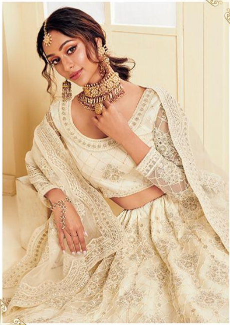
Fashionable tributes to color & silhouettes that have inspired trends around the world