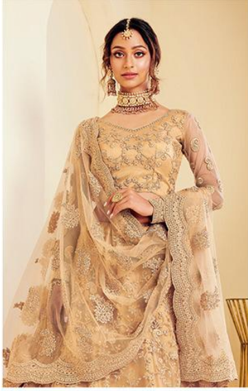
The contemporary design for the fashion conscious woman while preserving the traditional art and culture of India 1001-E