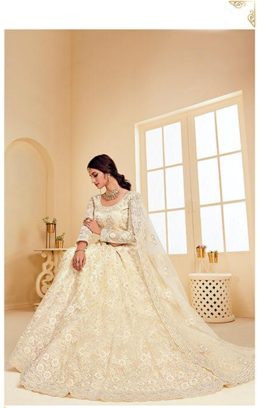
Simple without letting us of elegance & tradition with natural fabrics 1003-D