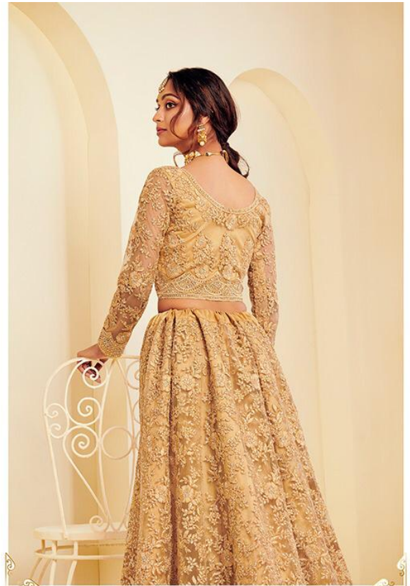
Luxe fabrics, bold patterns & sumptuous detailing adorn modern silhouettes