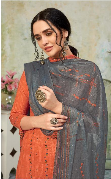
Experience the exotic floral bliss in soft hues and embroidered floral design. | 698 008