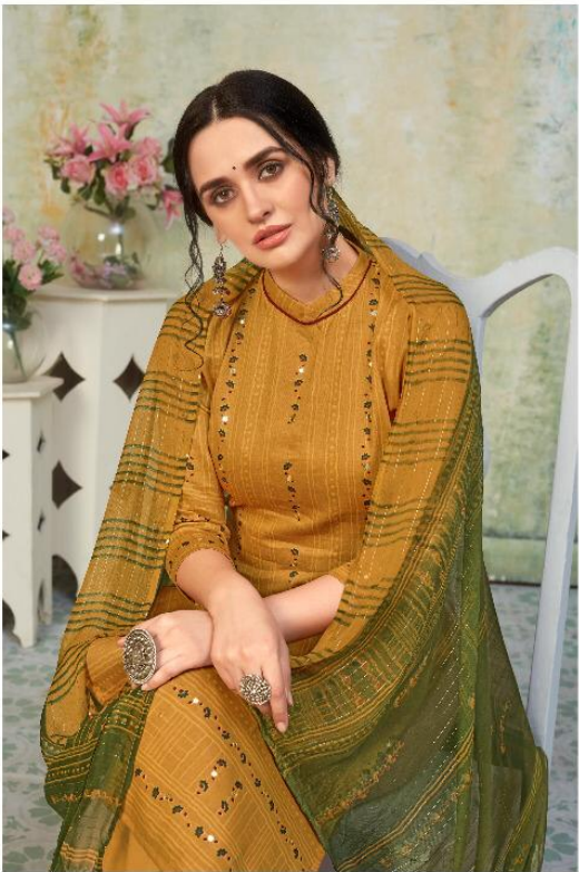
Embroidery and thread work which has added a real charm to women clothed in this collection. | 698 005