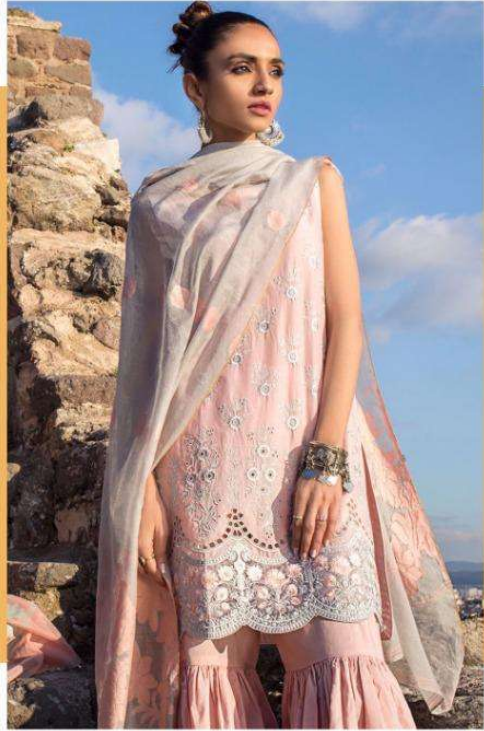
With time, but style is something that remains with you forever.