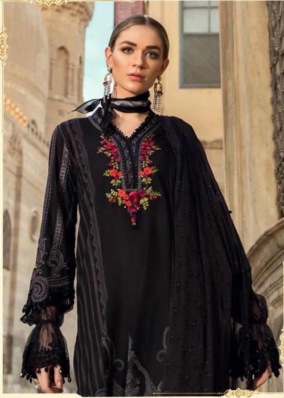
You have to get dressed in the morning, so you might as well make it fun 802