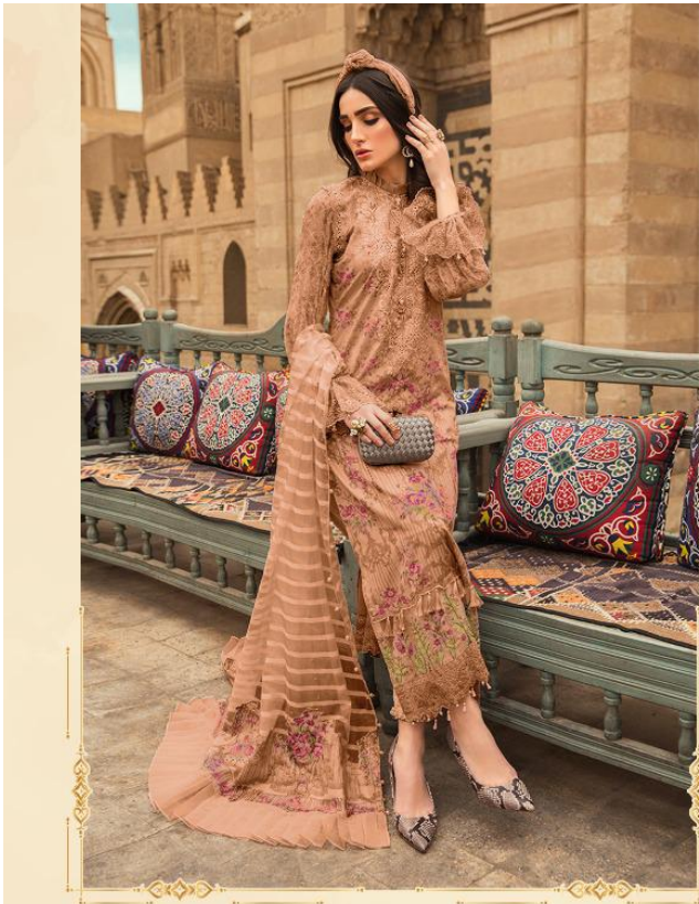
Style isn't about what you wear, it's about how you live 801