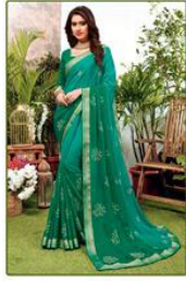
◊ 6658 ◊