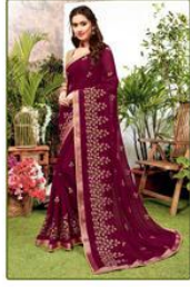
◊ 6655 ◊