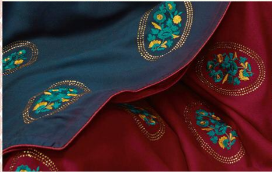
She is a beauty without parallel, and her beauty intensifies without boundaries.