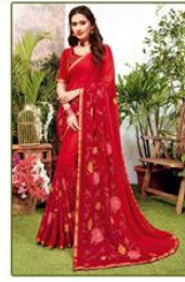
◊ 6659 ◊