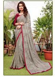
◊ 6661 ◊