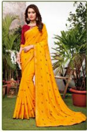
◊ 6651 ◊