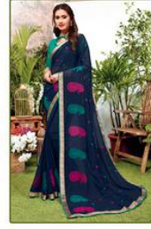
◊ 6663 ◊