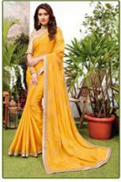
◊ 6656 ◊