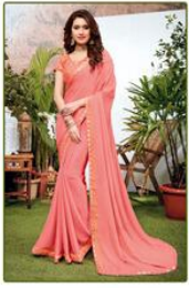
◊ 6650 ◊