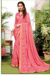
◊ 6654 ◊