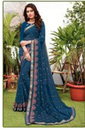
◊ 6652 ◊