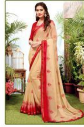
◊ 6665 ◊