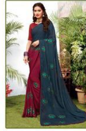
◊ 6666 ◊