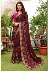
◊ 6653 ◊