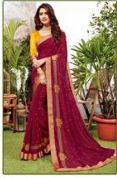
◊ 6657 ◊