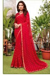
◊ 6662 ◊