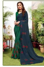
◊ 6660 ◊