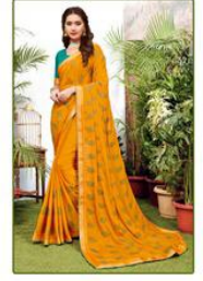
◊ 6664 ◊