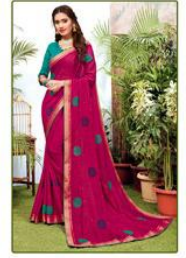
◊ 6667 ◊