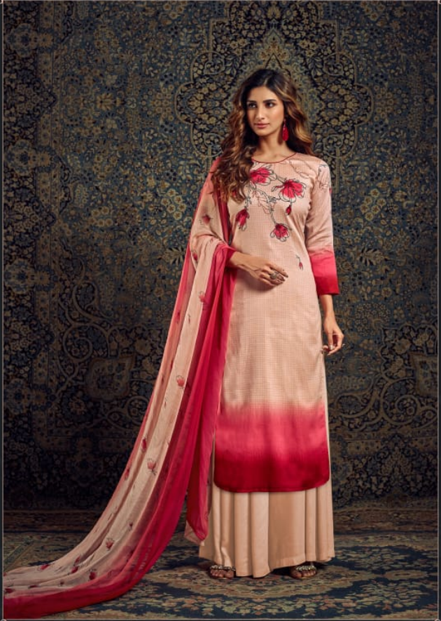
Bright colour is one of the strongest fashion statement of the season and bold designs give fashion a more ethereal and exotic effect.