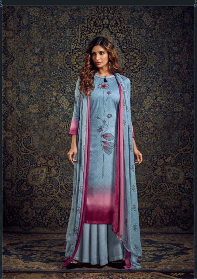
Light colour is one of the strongest features amongst of the women and full changes give fashion a more elevated and exotic effect.