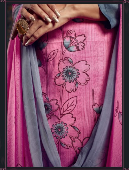
Thoughtful color is one of the strongest fashion statements of the season and bold designs give fashion a more editorial and iconic appeal.