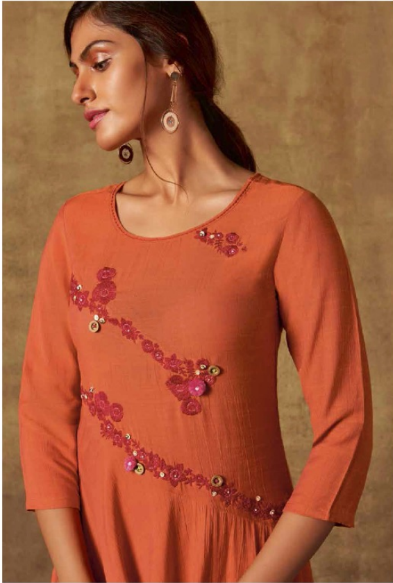
Our elegant design with the flowing fabric that allows the ease of comfort with graceful of color and once paired with styling. This look is a complete and elegant expression to our designs and "MIRAZAR"