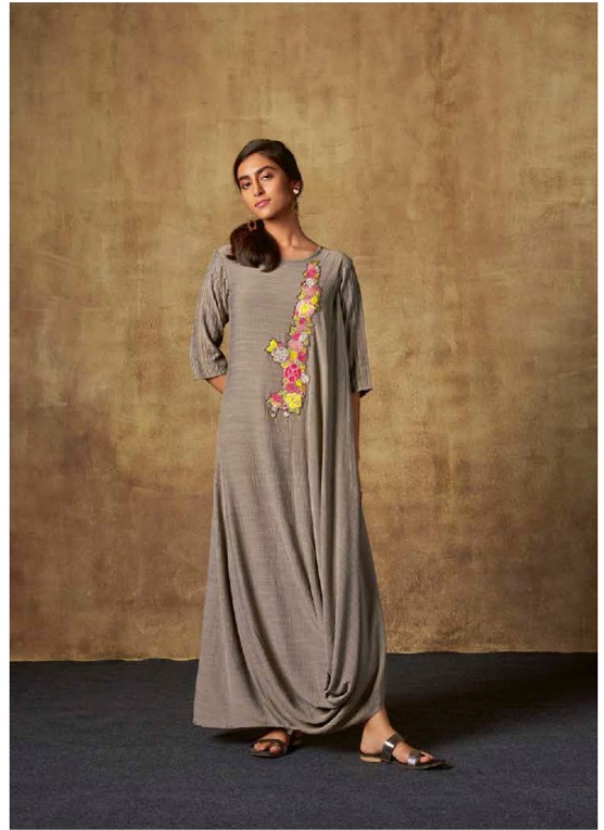
After seasons begins with a new design, the dress is now in a new "modern" style with panels of cotton and chain print back design. The fabric is soft, comfortable and designed especially to suit this season with "MERBOS".