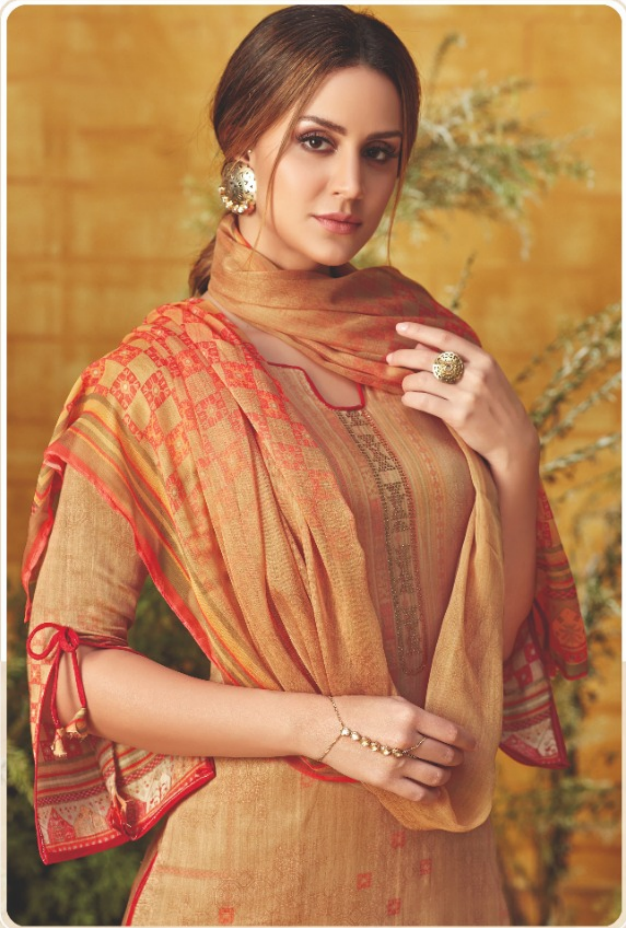
A breath taking away of fine detailing & intricate design inspired by Indian culture