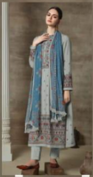
DESIGN NUMBER A - 790