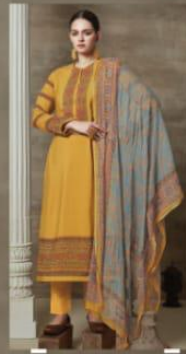
DESIGN NUMBER A - 762