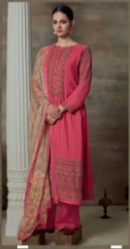
DESIGN NUMBER A - 768