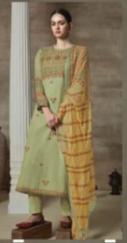
DESIGN NUMBER A - 726