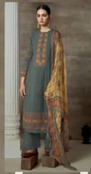
DESIGN NUMBER A - 785