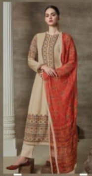
DESIGN NUMBER A - 718