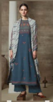
DESIGN NUMBER A - 703