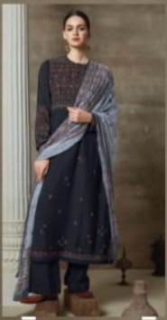
DESIGN NUMBER A - 761