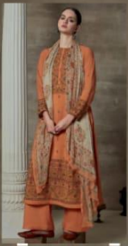
DESIGN NUMBER A - 799