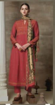
DESIGN NUMBER A - 733