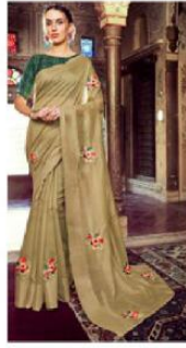
D.NO. - 3933