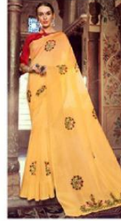
D.NO. - 3939