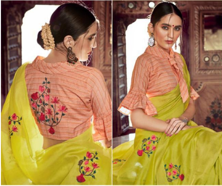
D. NO. - 3934