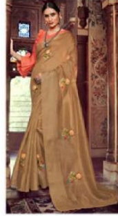
D.NO. - 3938