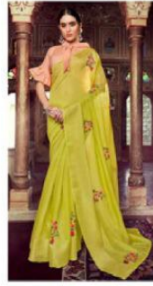
D.NO. - 3934