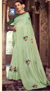
D.NO. - 3937