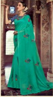
D.NO. - 3935