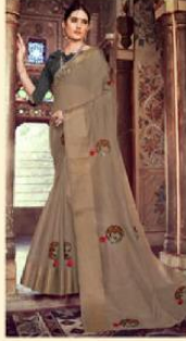
D.NO. - 3936