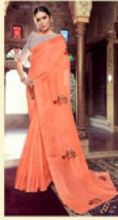
D.NO. - 3932