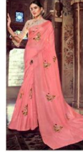
D.NO. - 3940