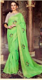
D.NO. - 3931