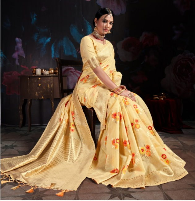
Be a center of attraction in any occasion in this beautifully printed designer saree.