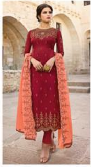
D. NO. 18075