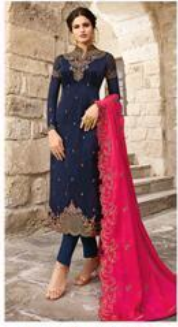
D. NO. 18072