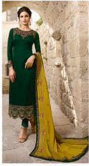
D. NO. 18074