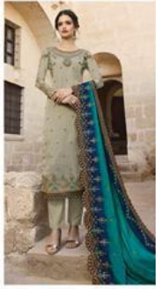
D. NO. 18076