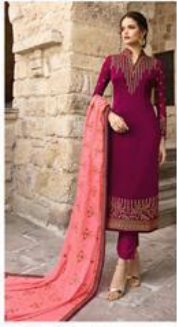
D. NO. 18073