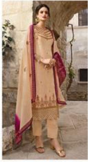
D. NO. 18077