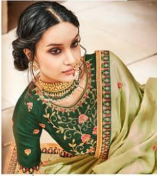
PISTA HANDLOOM SILK SAREE WITH BOTTLE GREEN BORDER AND BLOUSE D.NO.:-1056