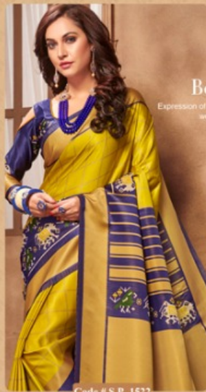
Code # S.P. 1522