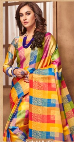
Code # S.P. 1524