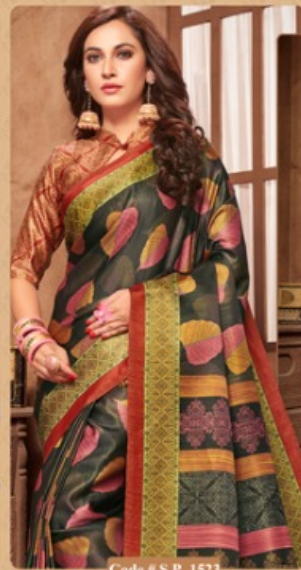
Code # S.P. 1523