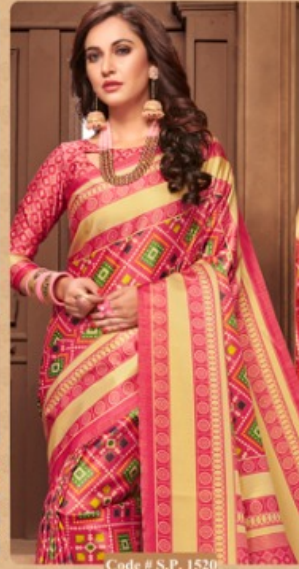
Code # S.P. 1520