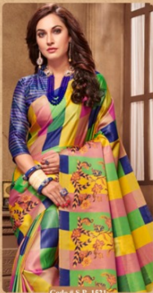
Code # S.P. 1521