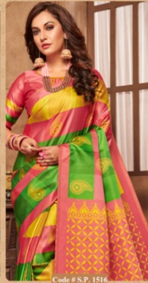
Code # S.P. 1516