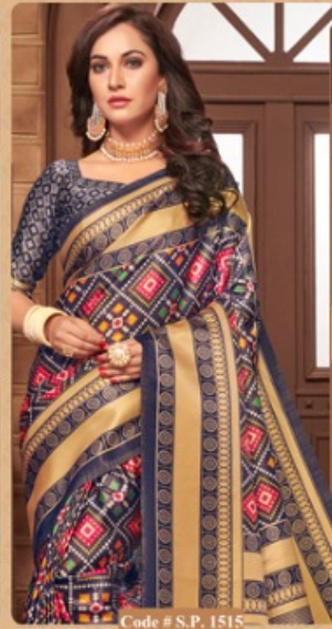
Code # S.P. 1515