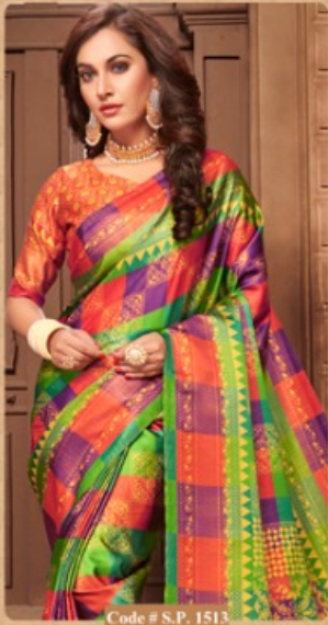
Code # S.P. 1513