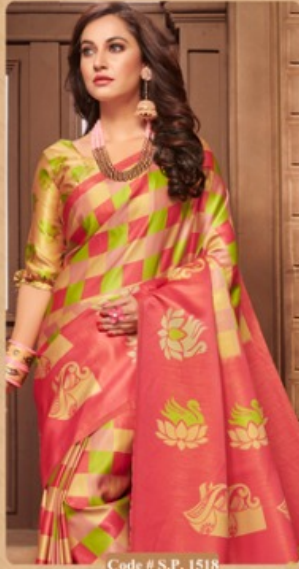
Code # S.P. 1518