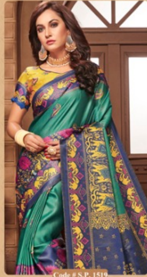
Code # S.P. 1519