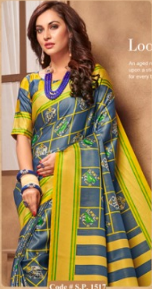
Code # S.P. 1517