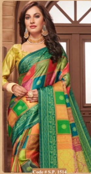
Code # S.P. 1514