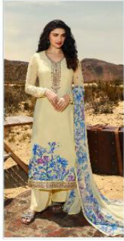
◆ 11852 ◆