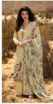
◆ 11856 ◆