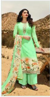
◆ 11855 ◆