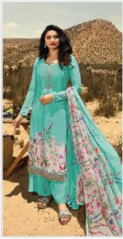
◆ 11854 ◆