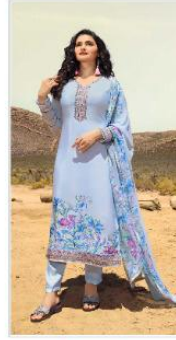
◆ 11857 ◆