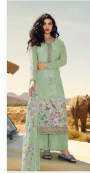
◆ 11859 ◆