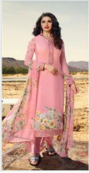
◆ 11851 ◆