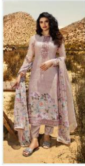
◆ 11853 ◆