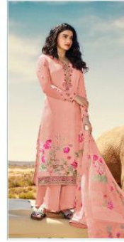
◆ 11858 ◆