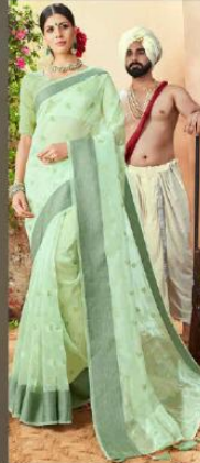
DESIGN NO. 57002