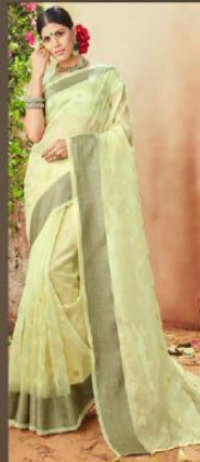
DESIGN NO. 57005