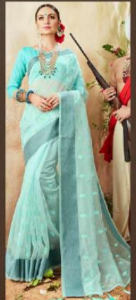
DESIGN NO. 57006