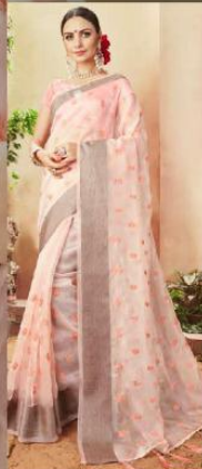
DESIGN NO. 57004