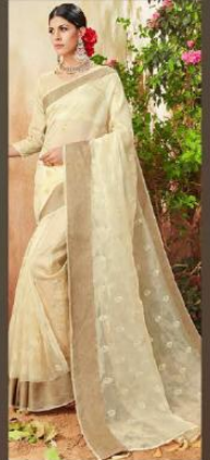
DESIGN NO. 57003