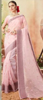
DESIGN NO. 57001