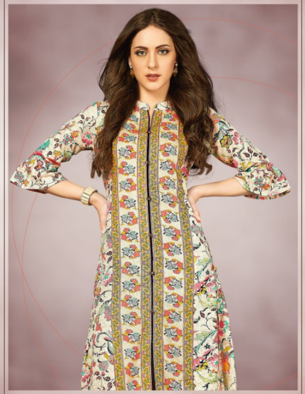
Creme Georgette Cowled tunic with Colding Embroidered neck & Pearl Embellishment on by infinity Creations. Beautifully Tailored With Pleats.