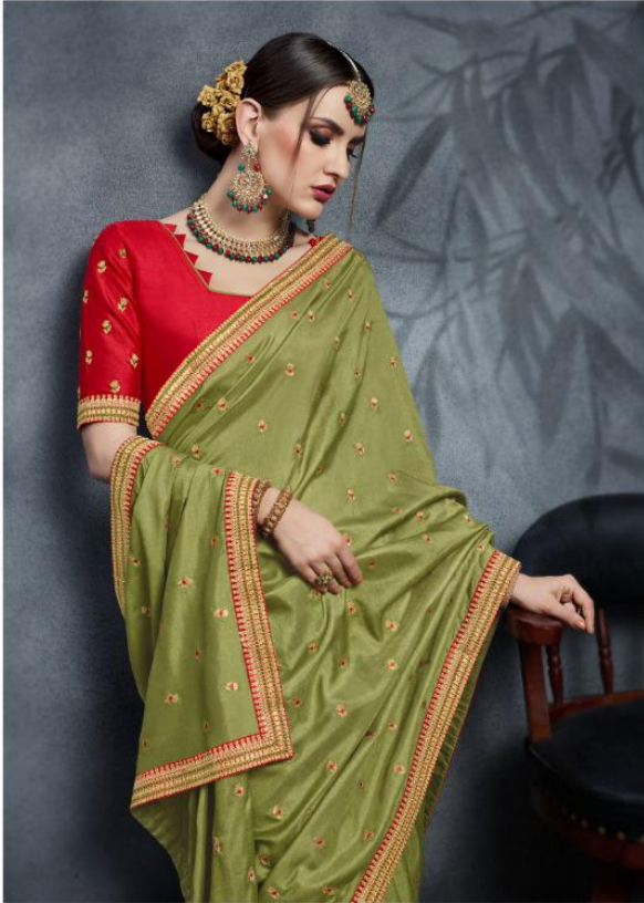
THE APPEARANCE OF FACIAL FEATURES AND ORNAMENTS IS FOR ILLUSTRATION PURPOSES ONLY. THE APPEARANCE OF FACIAL FEATURES AND ORNAMENTS IS FOR ILLUSTRATION PURPOSES ONLY.