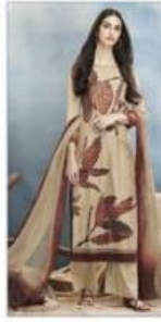
D.NO :- 7615