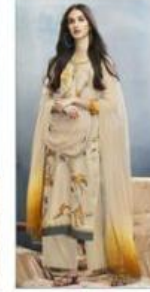
D.NO :- 7618