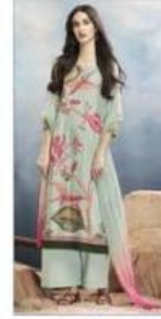
D.NO :- 7617