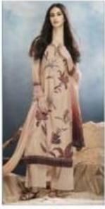
D.NO :- 7610