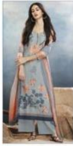
D.NO :- 7614