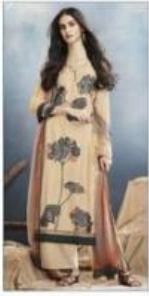
D.NO :- 7613