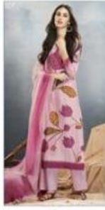
D.NO :- 7611