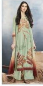
D.NO :- 7612