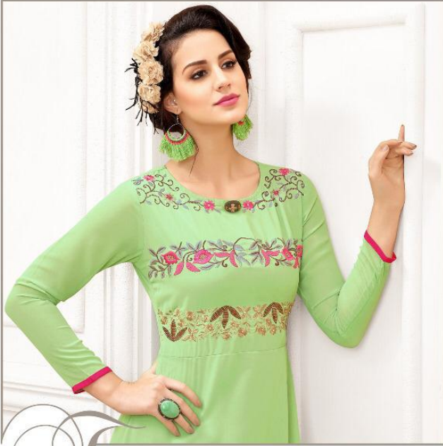
The Empress of glamour 3007

Many words go on you radiate the air of joy and grace. In a world full of and complete, you are the epitome of all that is still left perfect. Splendor and charm flow from you and consume everyone around you. Maybe it's your image. Maybe it's the magic of your garments.