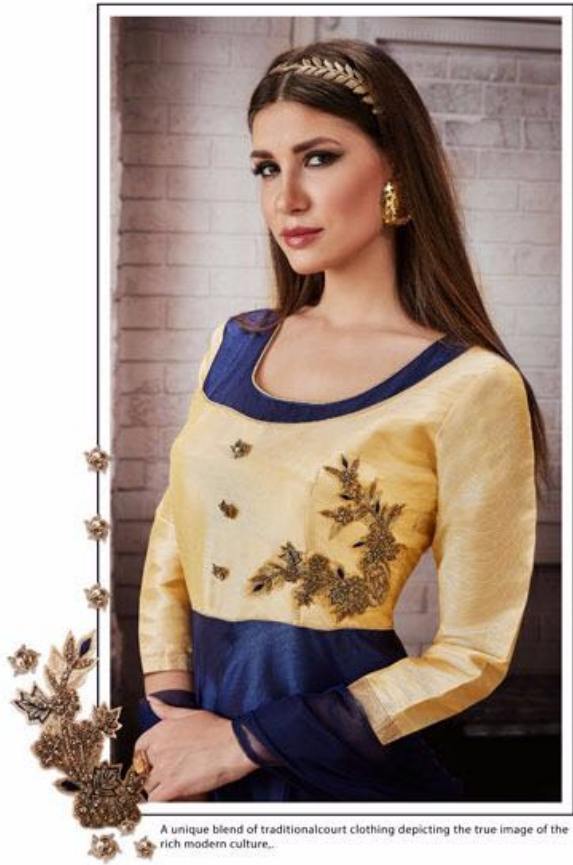
A unique blend of traditional court clothing depicting the true image of the rich modern culture.